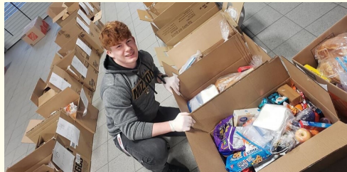
Cotton volunteering at Step Up STL.