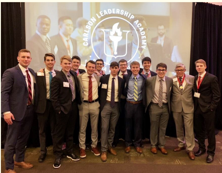
Our brothers at the Carlson Leadership Academy in Chicago in February. 13 MO Alpha brothers attended the weekend event where they learned important leadership skills.